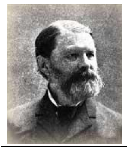
Robert Lowry – 1826 -1899